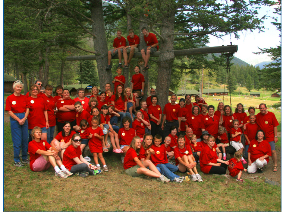
Summer Family Camp 2008